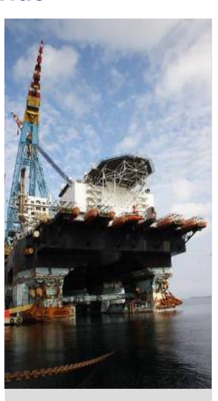
Oil & Gas Industry