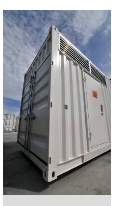
Tailor made generating sets